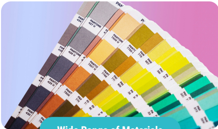
Wide Range of Materials