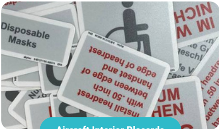
Aircraft Interior Placards