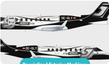
Specialized Exterior Markings